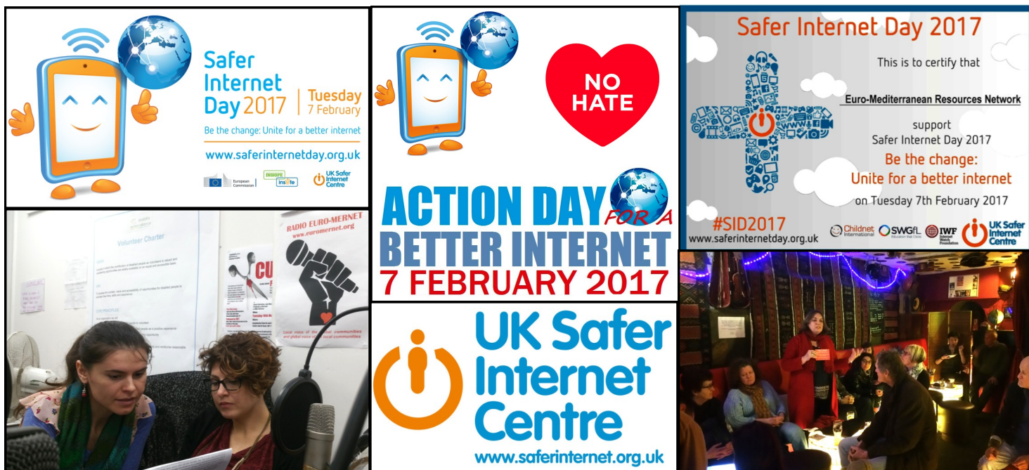
UK Action Day poster; promoting it on the radio show ♦ NHSM & UK Safer Internet Centre posters ♦ Our supporter certificate; Action Day talk at Film Club

“Be the change: Unite for a better internet!”