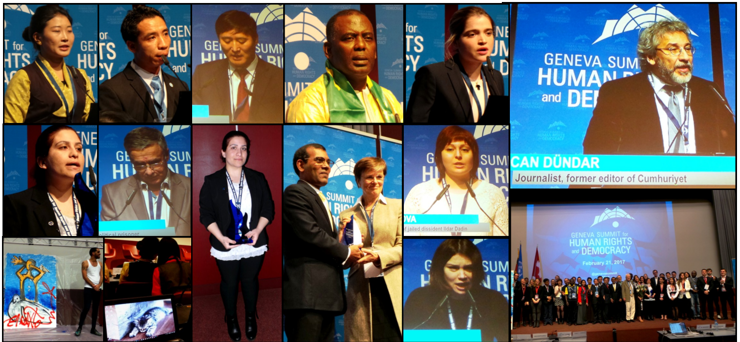
Some of the speakers at The Geneva Summit for Human Rights and Democracy, 21 February 2017. Full report, photos & videos at: www.genevasummit.org

Can Dündar: Turkey is "world's biggest jail for journalists"