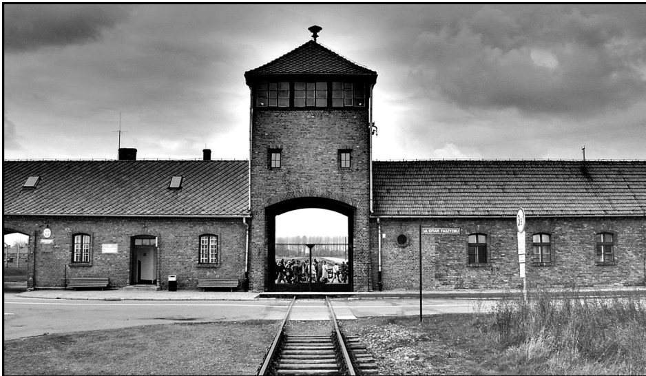
Auschwitz-Birkenau Concentration Camp Complex

First they came for the Communists And I did not speak out Because I was not a Communist Then they came for the Socialists And I did not speak out Because I was not a Socialist Then they came for the trade unionists And I did not speak out Because I was not a trade unionist Then they came for the Jews And I did not speak out Because I was not a Jew Then they came for me And there was no one left To speak out for me.